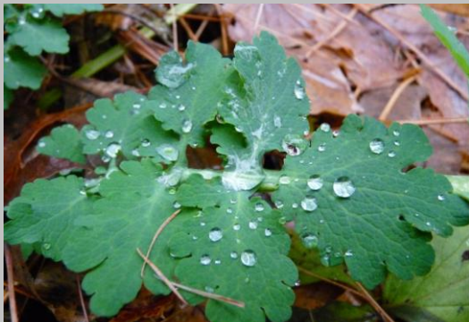
Greater Celandine Chelidonium majus