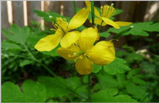
Greater Celandine flower